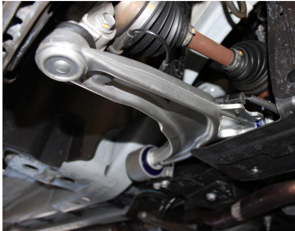
View of underside of car right hand side shown with arm assembly installed

Note: ALOY0010K, ALOY0011K AND ALOY0012K Front Lower Control Arms Kit must be fitted to both sides of the vehicle.