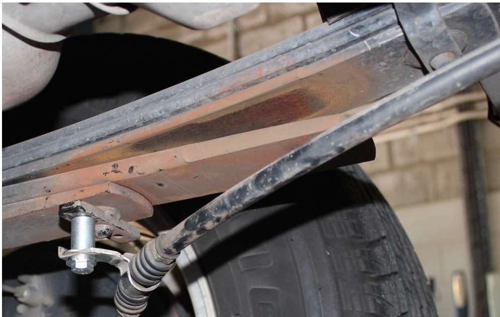
Figure 1: Spacer relocation kit

If your leaf spring looks like Figure 1 then go to Page 2 and follow the install instructions outlined and discard any leftover parts.