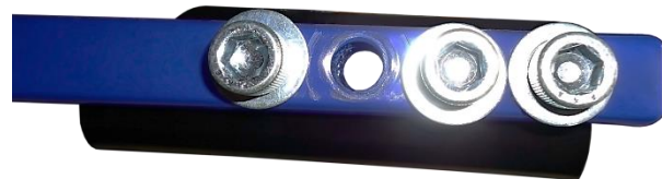
Full hard position