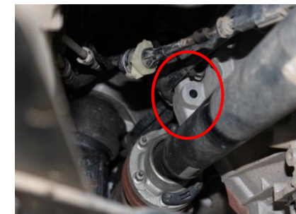
Figure 3 - Location of gear selector and its attaching point to transmission