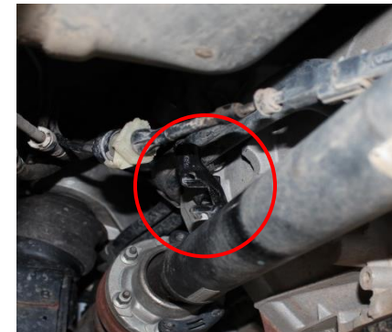
Figure 2 - bracket in place