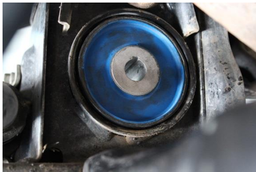
Figure 5 - Diff side of housing with SPF4897 bush in housing (light blue side showing, view from inside of subframe)