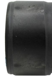
Figure 1 - SPF4897 with 2 x lead ins