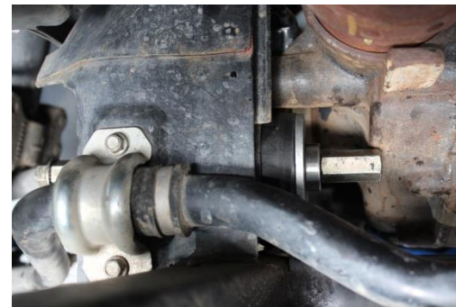
Figure 6 - pulling bush in evenly