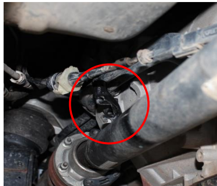
Figure 4 - bracket in place