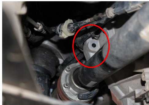
Figure 2 - Location of gear selector and its attaching point to transmission