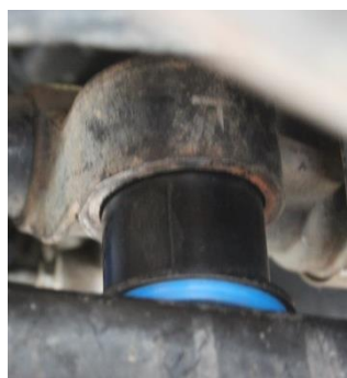
Figure 3 - new polyelast bush