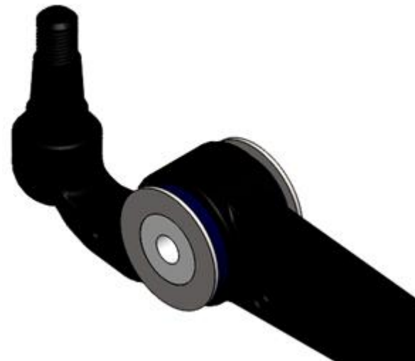
Figure 2: Bushing Installed