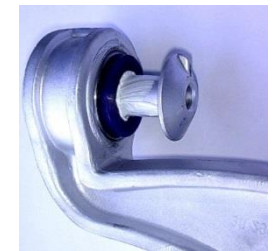
Original crush tube cleaned, lubricated and partially installed.