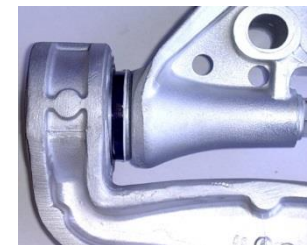
SPF2934 fitted and assembled to cross member.