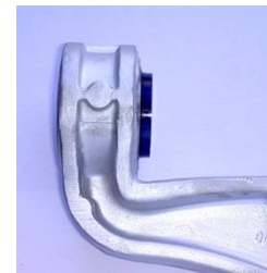
Bush 2934 fitted with polyurethane extended towards the rear.