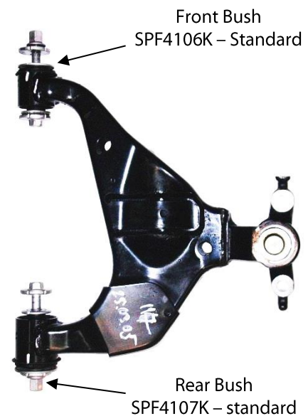
View from Rear of RHS