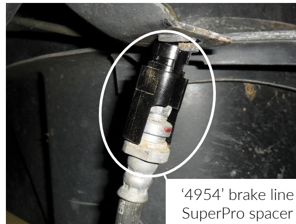
Figure 02 - Installing '4954' brake line spacer