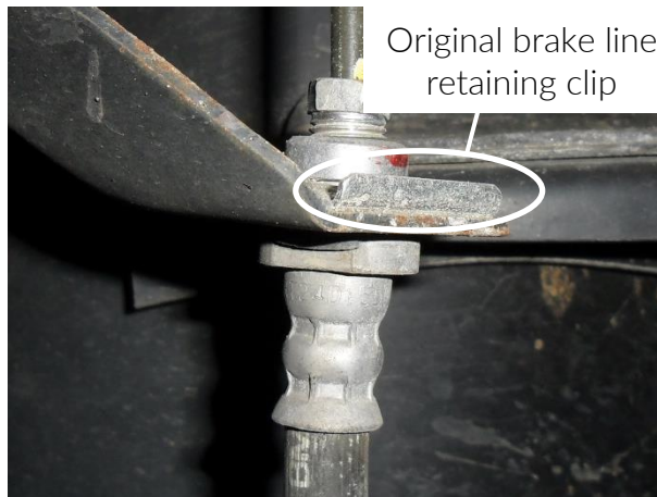
Figure 01 - Brake line, original setting