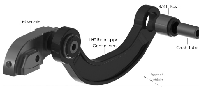
Figure 04 - Left Hand Side Upper Control Arm Outer Bush Installation