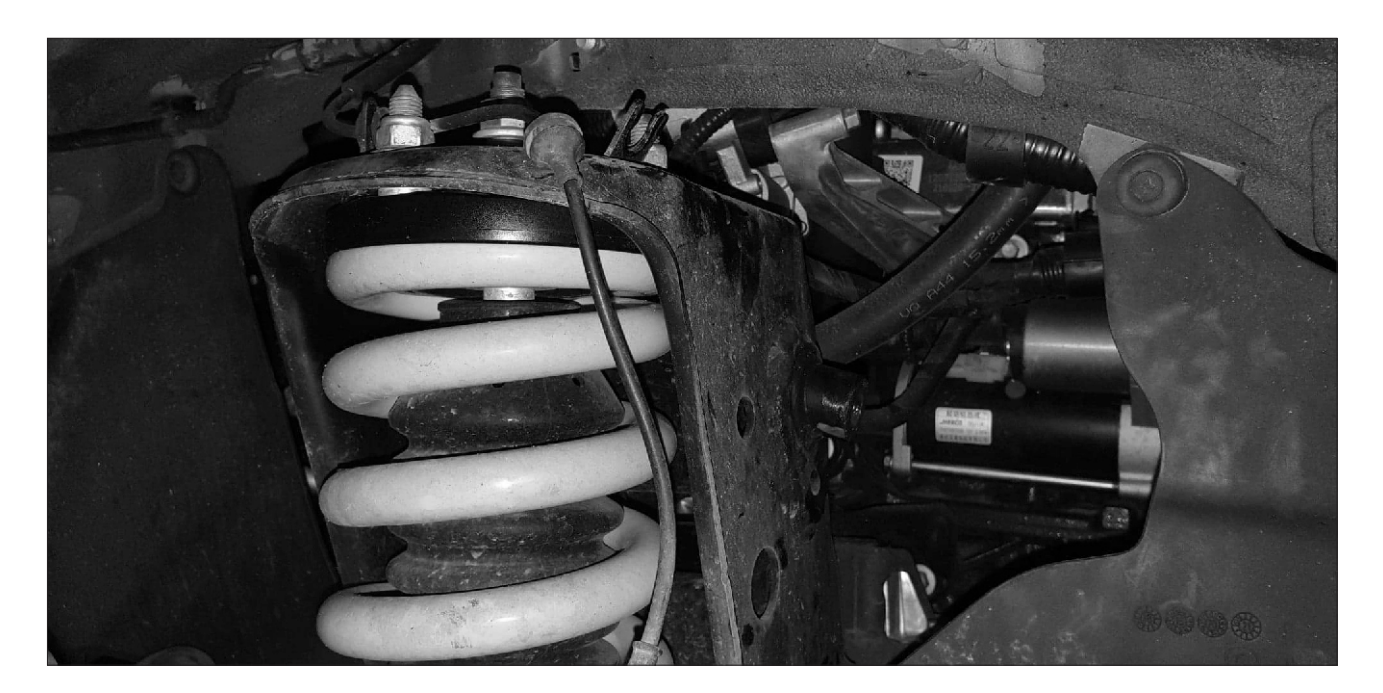
Arm removed from vehicle --- Refer Page 2 -

It is recommended that a licenced workshop or tradesperson carry out the above procedure and that workshop manual and relevant safety procedures are followed in addition to the above.