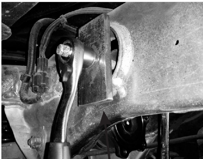
Note - home-made mechanical puller

• Road test. Re-check all bolts after 100kms travelled.