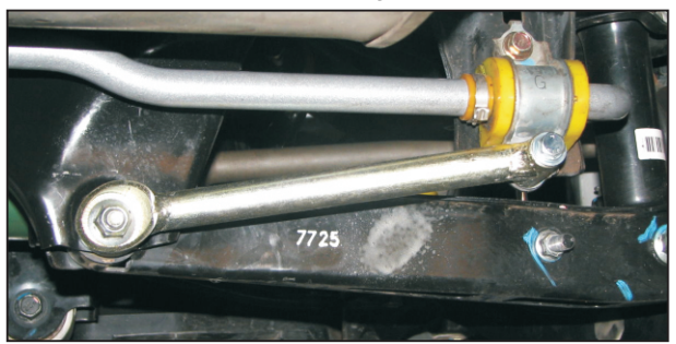
Fig 2 - RIGHT brace