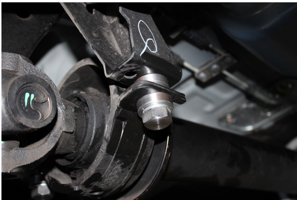
Diagram shown below is the start out position to eliminate vibration. Adjust as necessary.