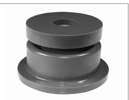
Thick Pad - on top

• Place either a thin or thick pad on top - refer table above.