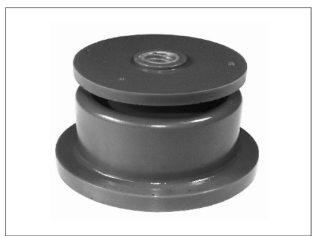
Thin Pad - on top