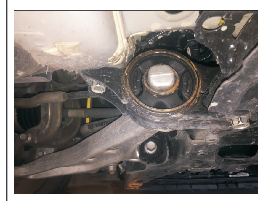
• Place vehicle on ramps or a 4-post hoist.

Install is best done with vehicle at normal ride height.