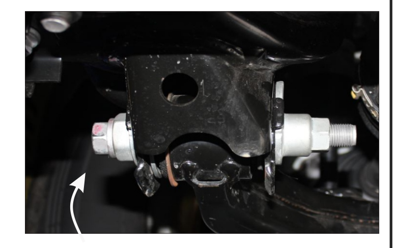
Note - the front bushing needs to be loosened via the bolt head, not nut