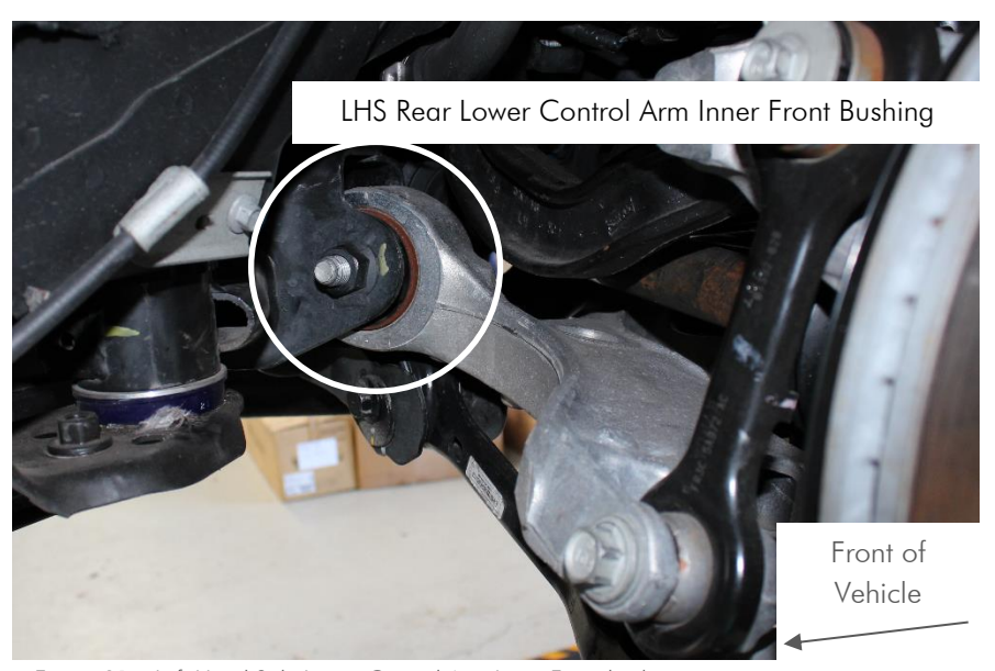
Figure 01 – Left Hand Side Lower Control Arm Inner Front bushing