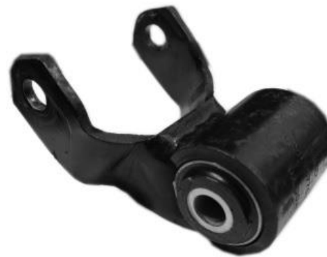
Rear, Spring Shackle with factory bushes (LEFT) and polyurethane bushes (RIGHT)