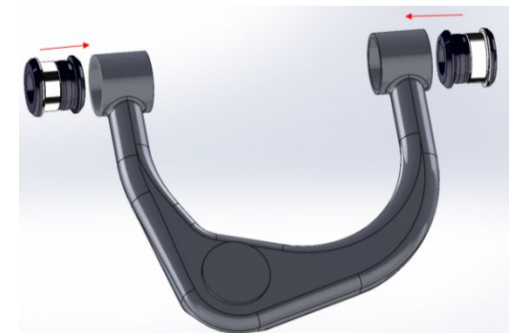
Left Hand Side Shown