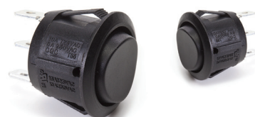
Dual Rocker Add-On Kit On-board manual adjustment

*Benefit is associated with specific kit/components please visit airbagman.com.au or call 1800 247 224