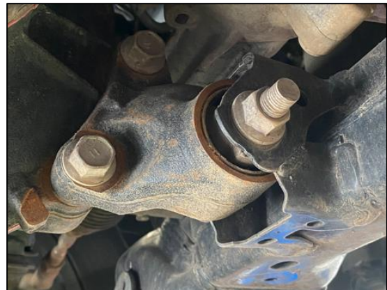
Figure 2: Forward Differential Brackets